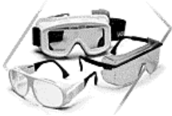
Typical laser eye protection. New rare earth doped laser lenses offer multi-wavelength protection while maintaining high visible light transmission.

Lasers used in dermatology and cosmetic surgery are now common. The following table lists several lasers used in dermatology and their typical uses (this list is not all-inclusive). The choice of the laser depends on the treatment required. Several lasers may be used for one specific treatment based upon need for certain wavelength or pulse duration.