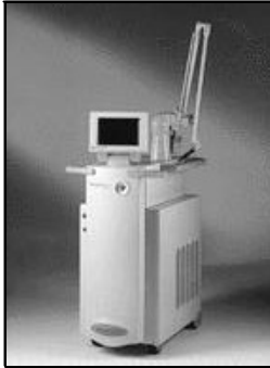
Dermatological Laser that offers 4 independent wavelengths for treatment purposes

The greatest increase in medical laser use during recent years has been in dermatology and plastic surgery. Possible ocular injuries are more likely to occur to physicians while using multiple laser wavelengths to perform dermatological surgery. This fact sheet provides information on the potential injury from lasers used for dermatological purposes such as tattoo removal, vascular lesions, and other procedures.